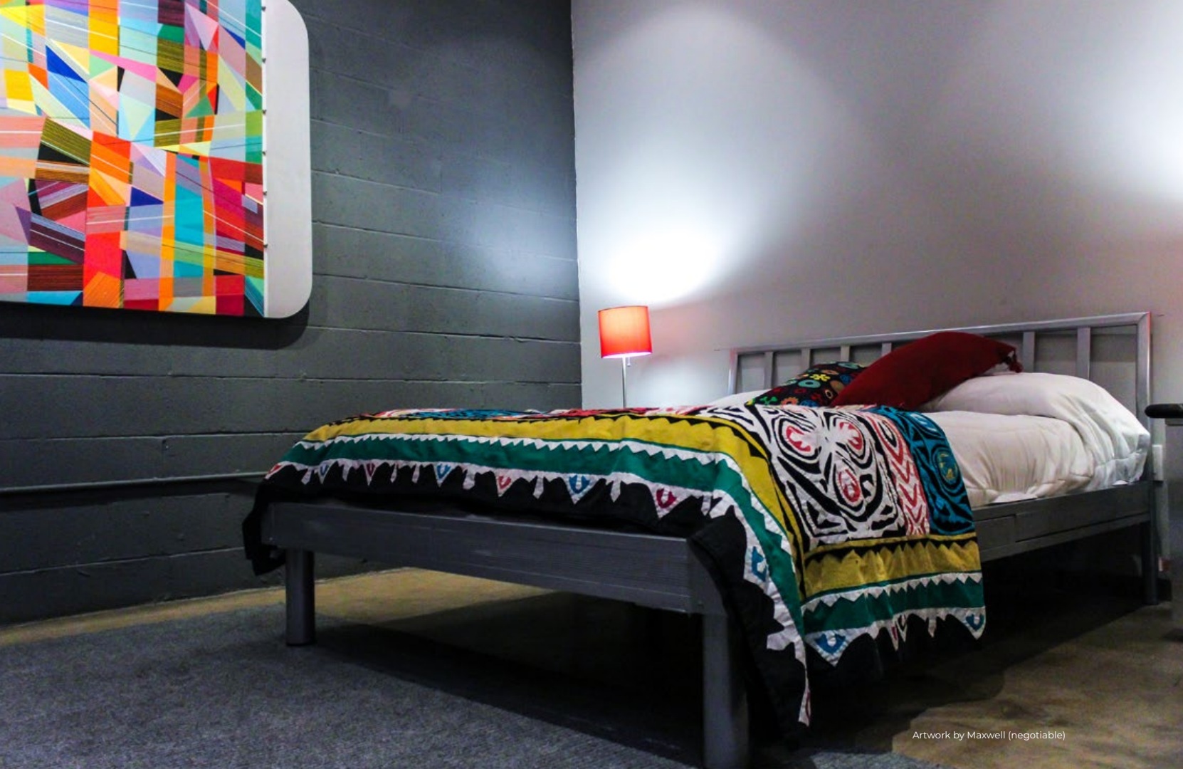
Artwork by Maxwell (negotiable)

Second bedroom could be converted to accommodate office space. Nearby guest bath includes custom fabricated stainless steel sinks and walk in shower.