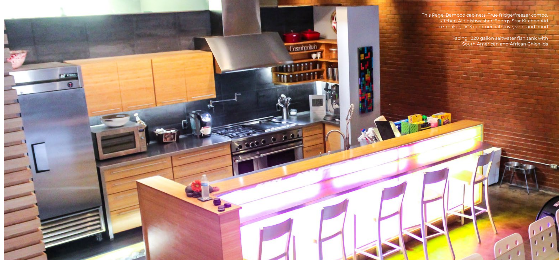
This Page: Bamboo cabinets, True fridge/freezer combo, Kitchen Aid dishwasher, Energy Star Kitchen Aid ice-maker, DCS commercial stove, vent and hood