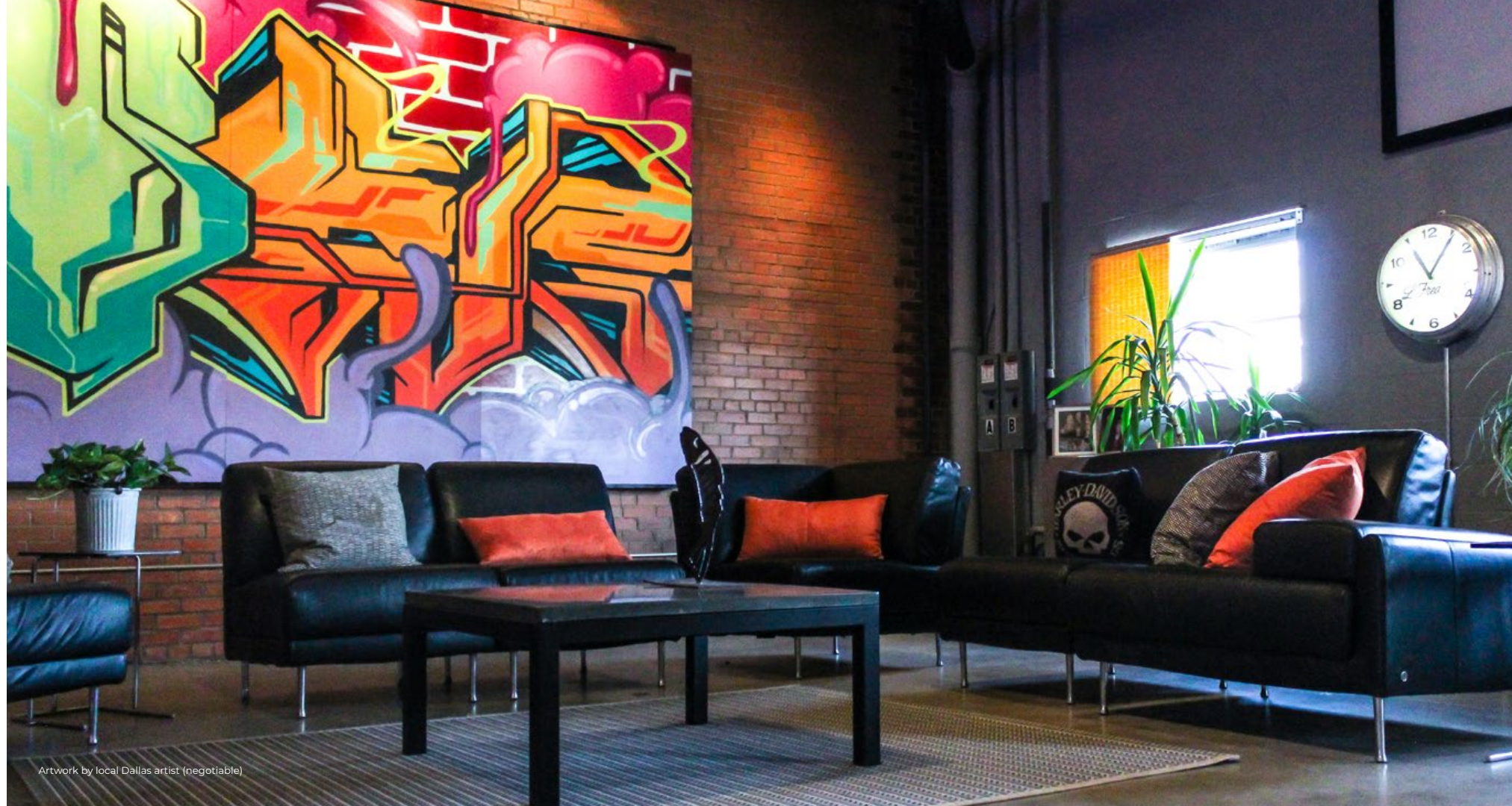
Artwork by local Dallas artist (negotiable)

In the heart of Deep Ellum sits a rarity: a 5,250 square foot converted warehouse with remarkable infrastructure. What you'll find is a unique urban contemporary property with design fitting of the creative spirit emanating in Deep Ellum. Property like this does not come on the market often, if ever. Take your chance to own in Deep Ellum at 2924 Taylor Street.