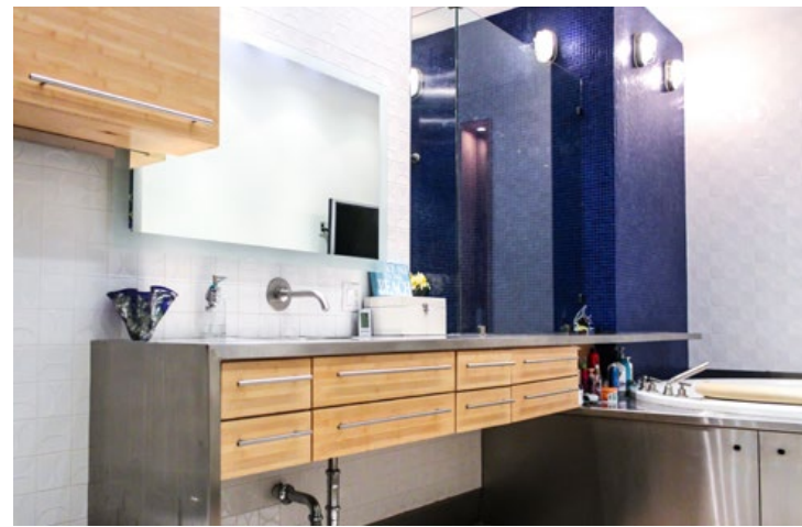
Open-format master bed with European-style master bathroom with walk-in shower and large soaking tub